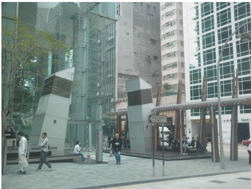
Figure 2: Ventilation facilities of MTR Admiralty Station of the Island Line are integrated with the pavilion and landscape outside the entrance of Three Pacific Place.