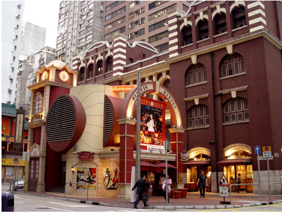
Figure 1: Ventilation facilities of MTR Sheung Wan Station of the Island Line are articulated to blend with the adjacent building.