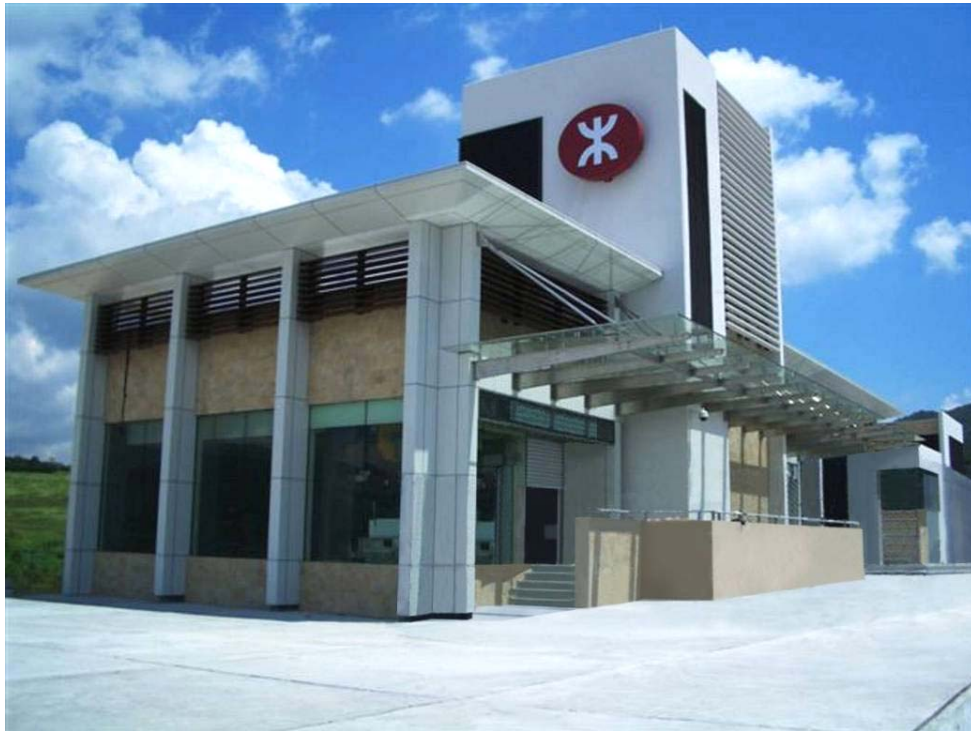
Figure 3: Ventilation facilities of MTR LOHAS Park Station of the Tseung Kwan O Line are merged with the station entrance.