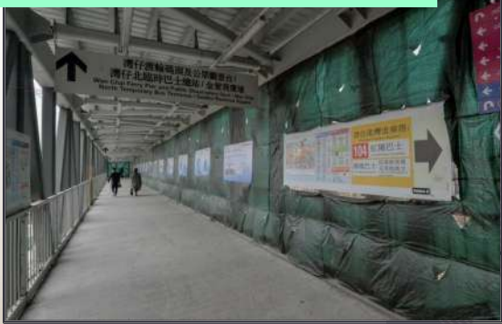
Footbridge across Convention Avenue

Remarks: Implementation date may be adjusted subject to weather and on-site condition. Please note the notice and information on site.